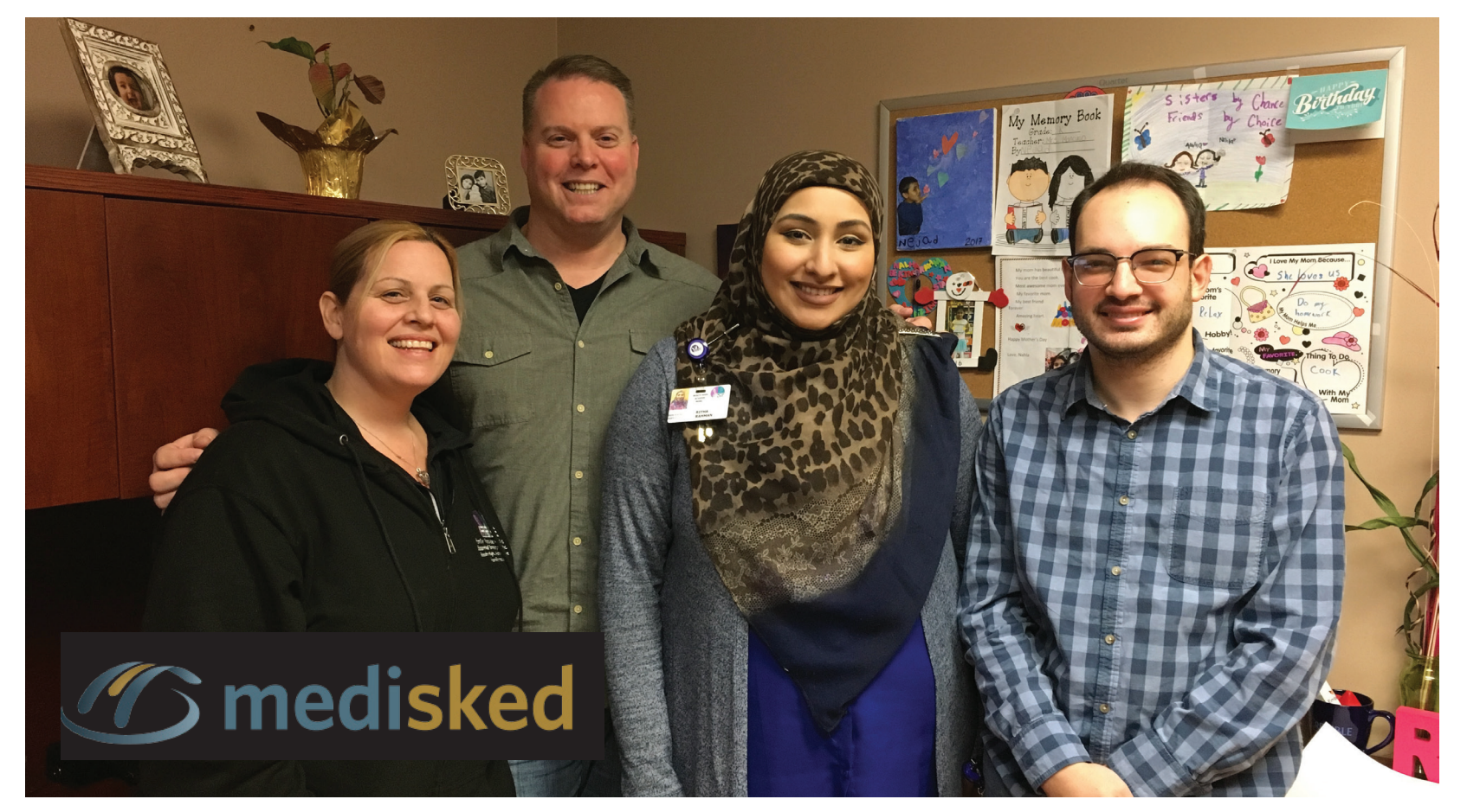
Health Information Team Announcement