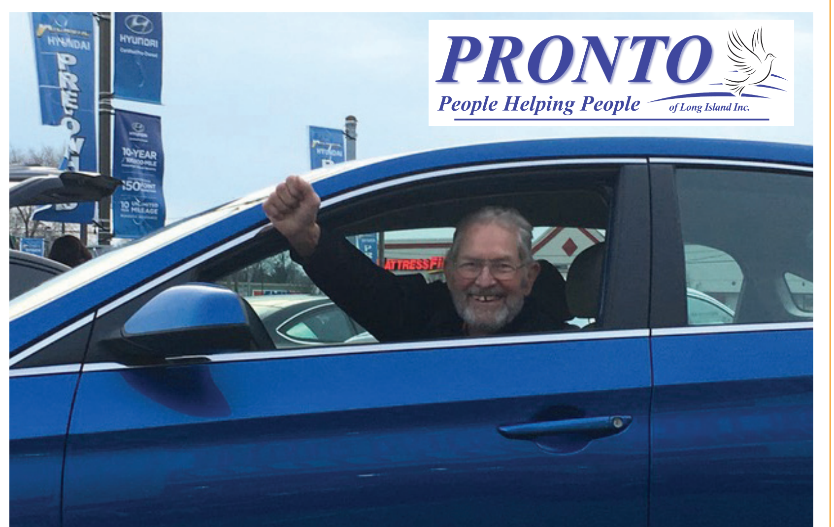
Pronto Car Raffle Winner