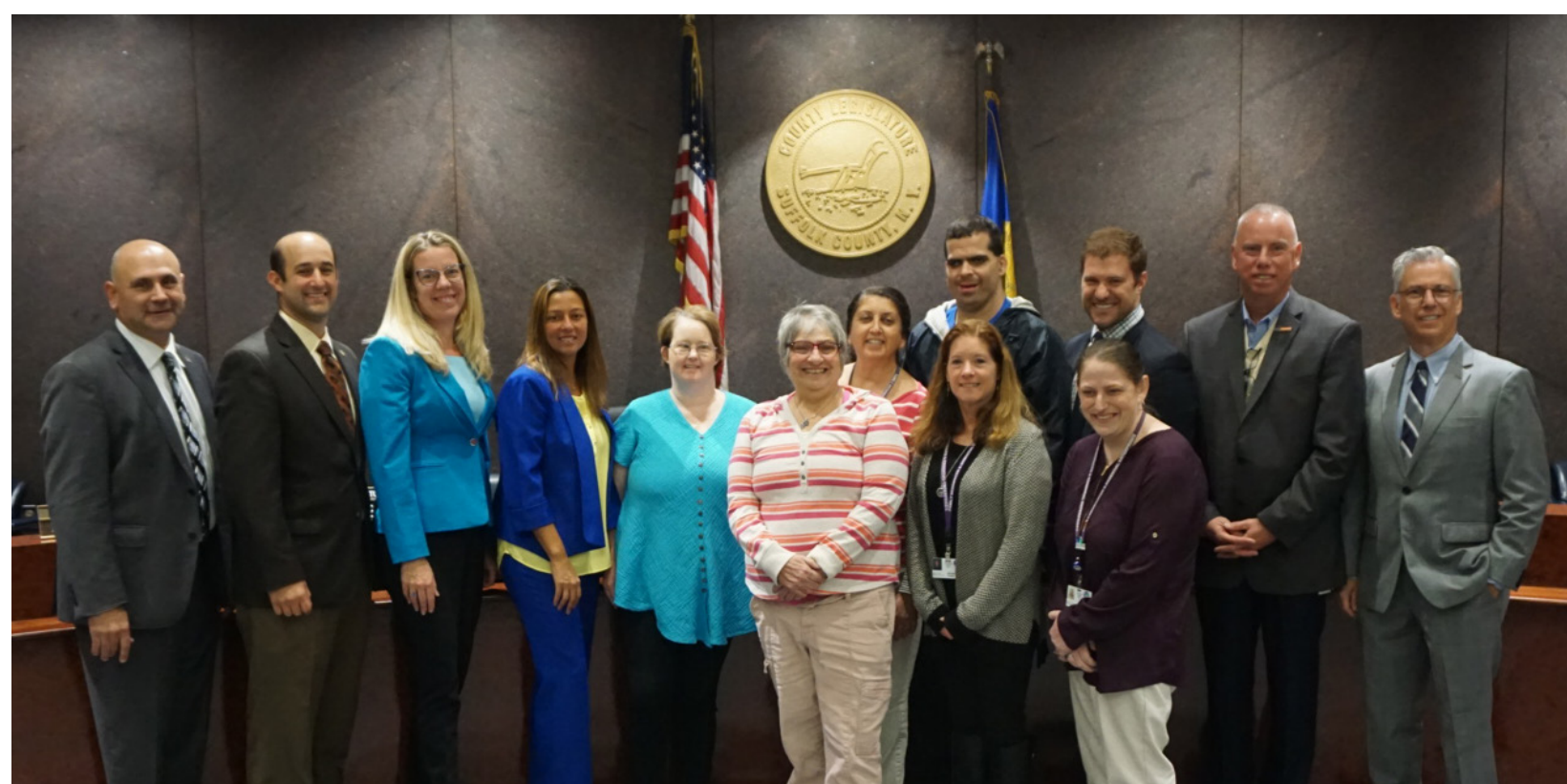
Speakers Bureau Meets with Education and Human Services Committee