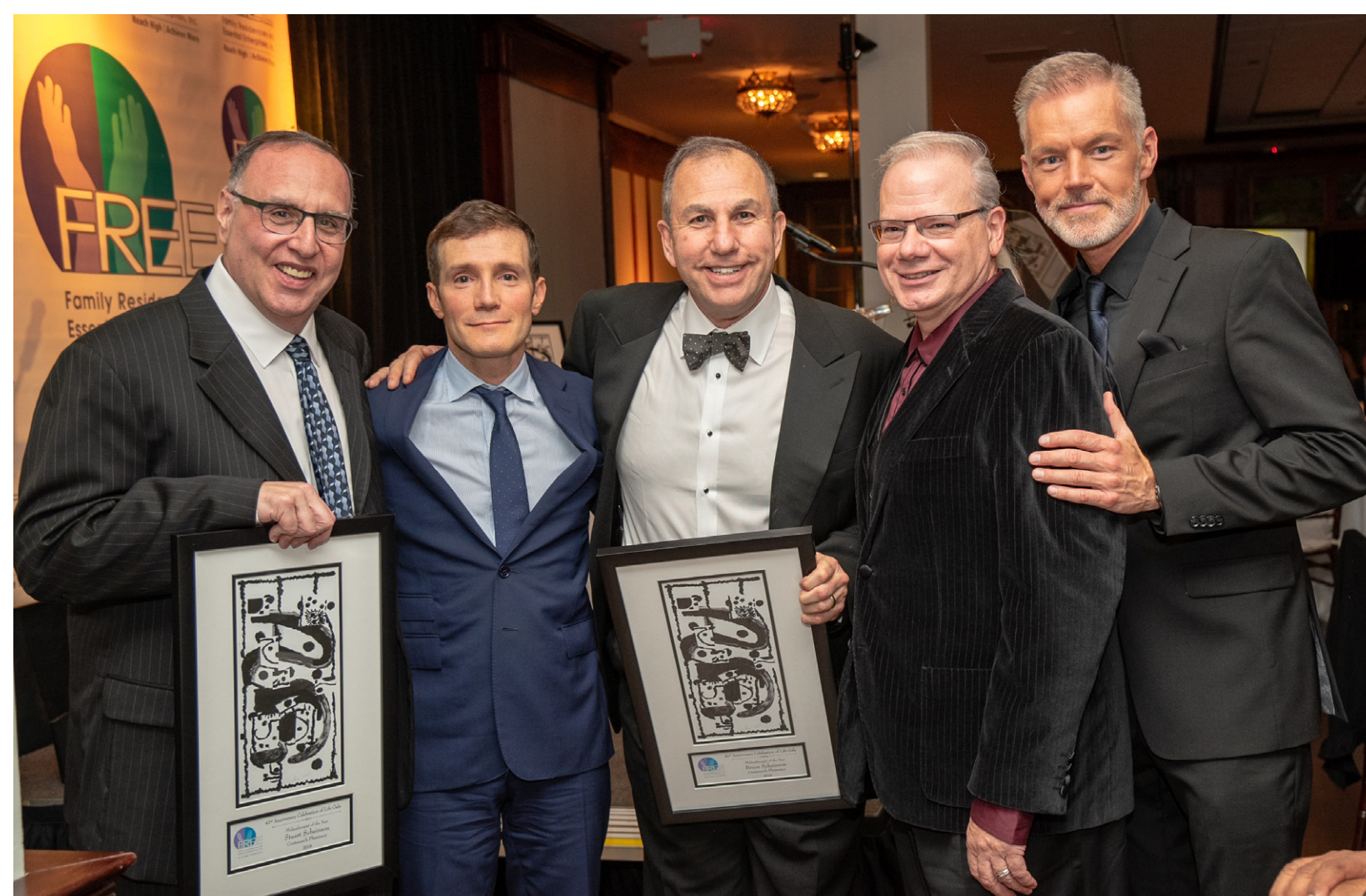
41st Annual Celebration of Life Gala