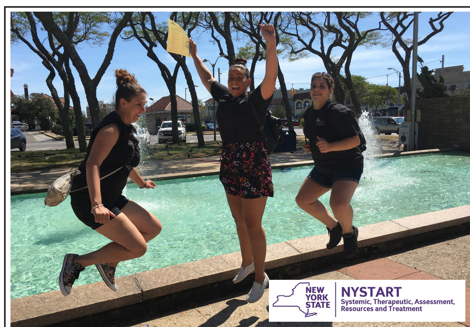
NY START Celebrates One Year with Team Building Exercise