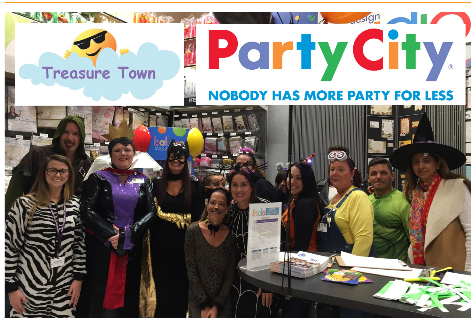
Valued Team Members' Families Receive Halloween Costumes