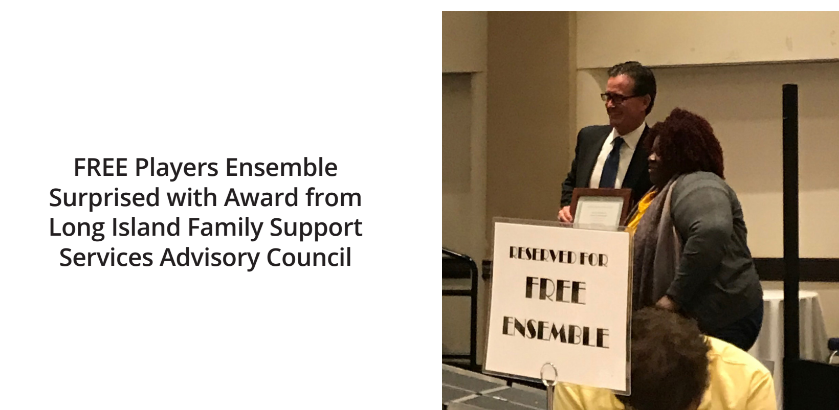
FREE Players Ensemble Surprised with Award from Long Island Family Support Services Advisory Council