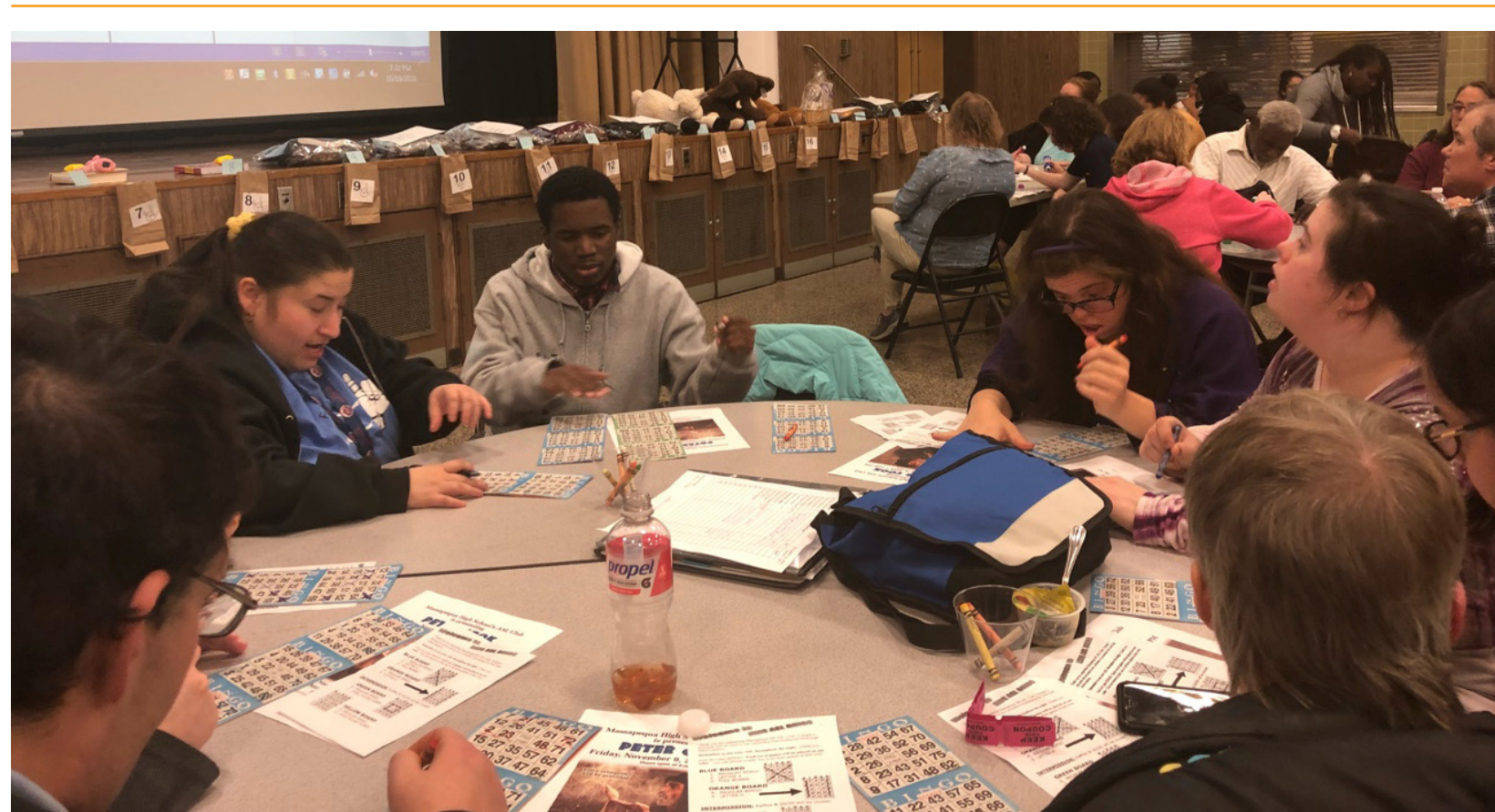
American Sign Language Group Attends Bingo