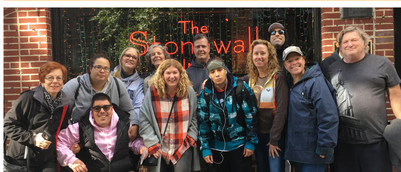
FREE To BE Members Enjoy a Tour of Stonewall Inn