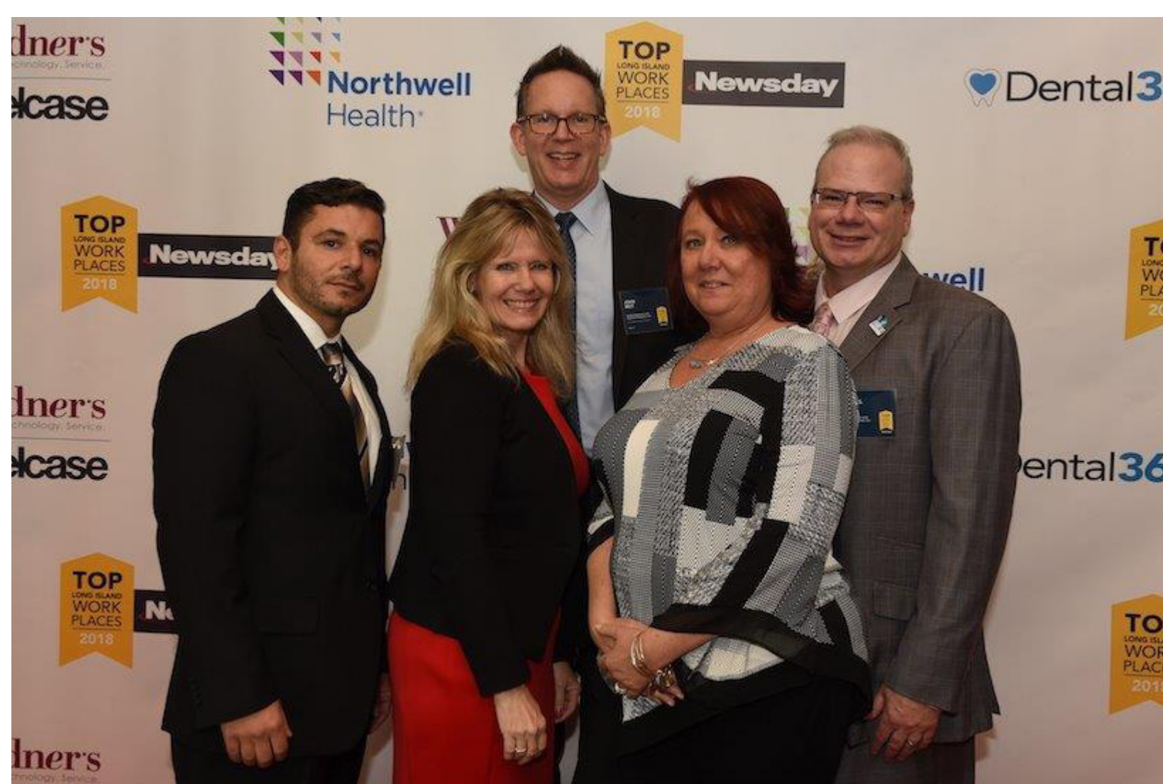
FREE Named a Top Workplace for 2018