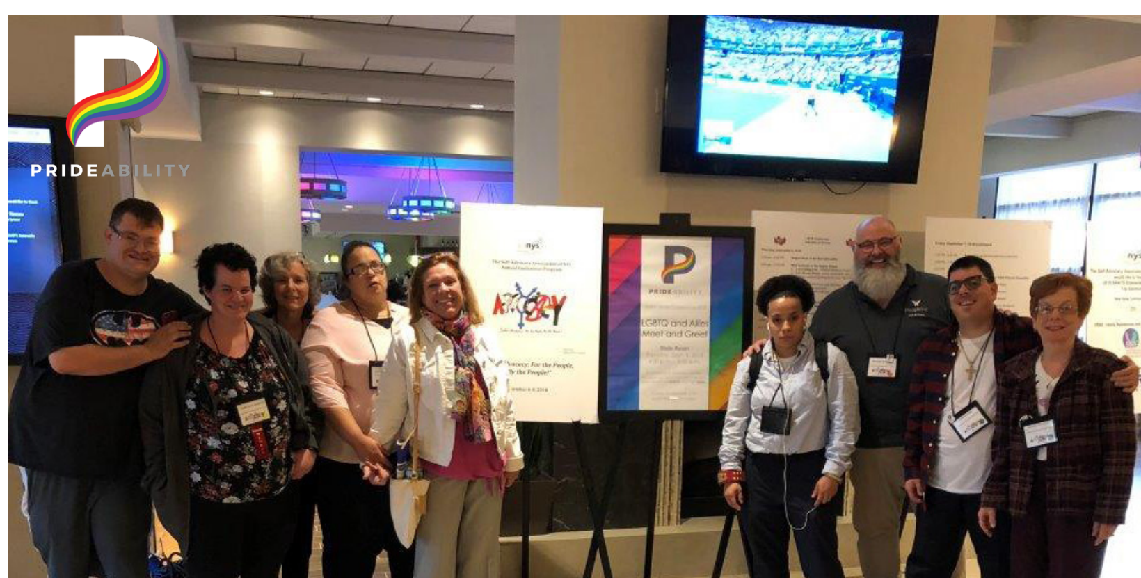
PrideAbility Team Participates in SANYS Conference