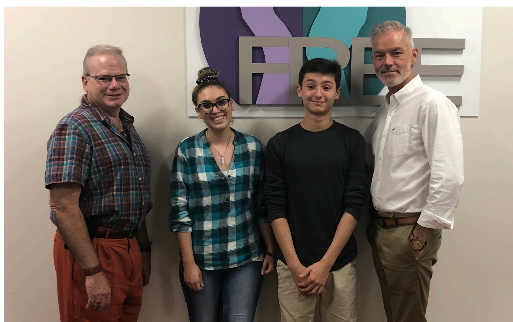
Local Students Contribute to FREE