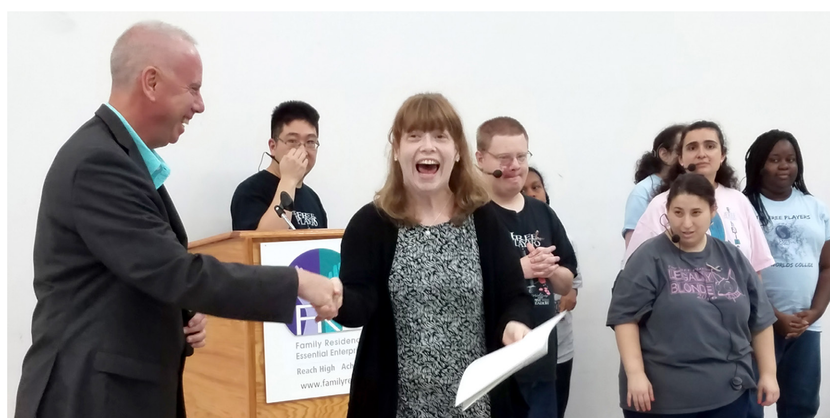
Members of the Speakers Bureau Receive Recognition