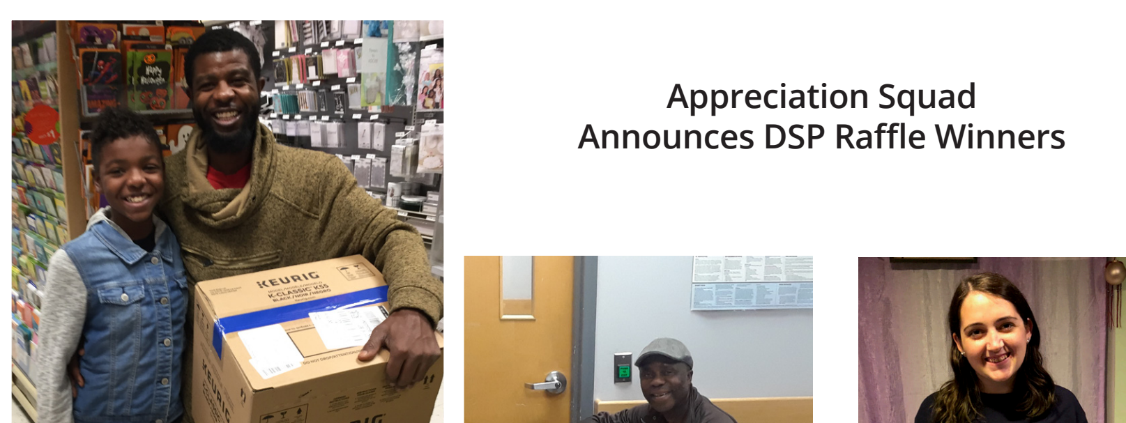
Appreciation Squad Announces DSP Raffle Winners