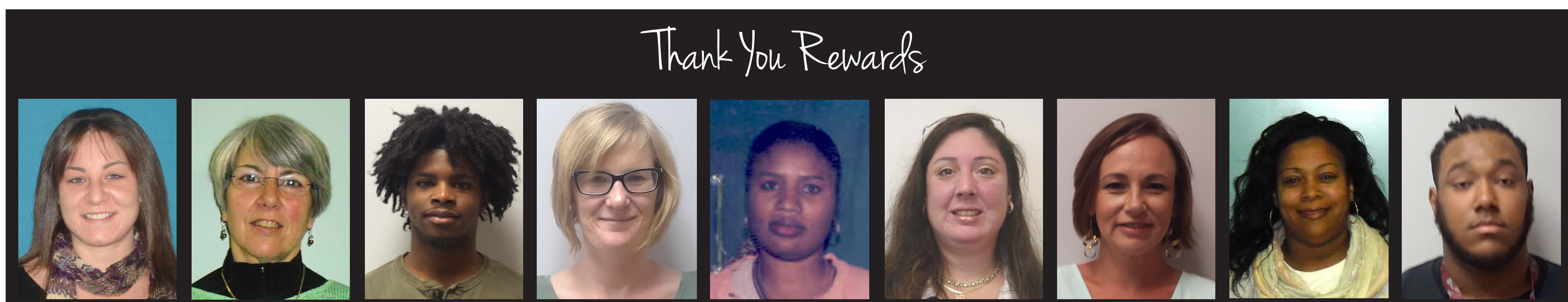
Thank You Rewards