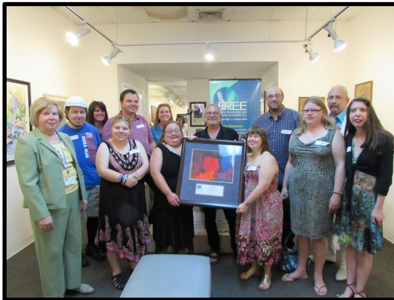
FREE Artists display their works

OLD BETHPAGE, NY - Family Residences and Essential Enterprises, Inc. (FREE) held a “Meet the Artists” reception at b.j. spoke gallery in Huntington on Saturday, July 11 th . The reception honored artists participating in their fine art and art therapy programs who were invited to exhibit their artwork at the gallery. The exhibit, “Breaking Boundaries 2015” ran throughout the month of July.