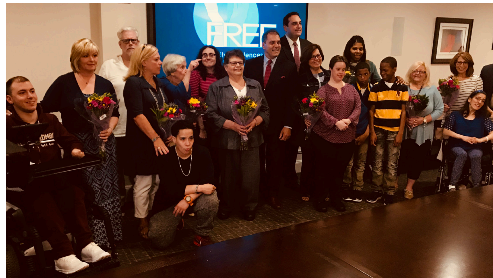
FREE Celebrates Mother's Day