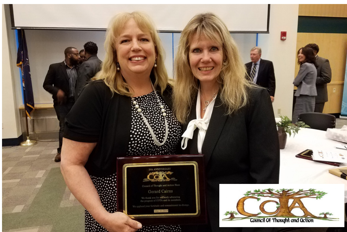
COTA's 10th Anniversary and Induction Ceremony