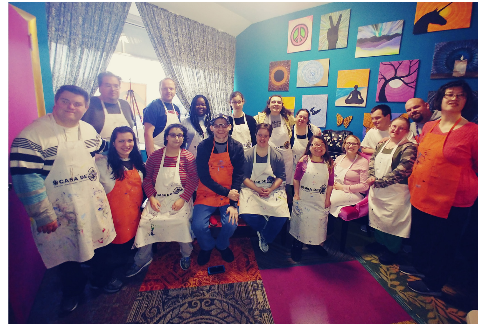
Volunteering for World Art Day