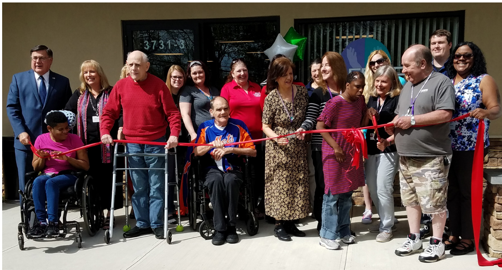
Medford Site Ribbon Cutting Ceremony