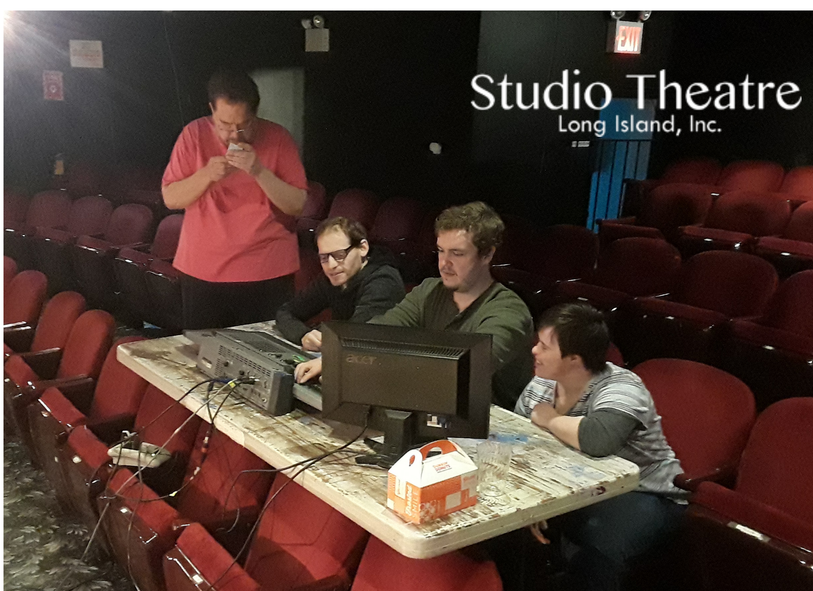
Individuals Learn Skills at Studio Theatre