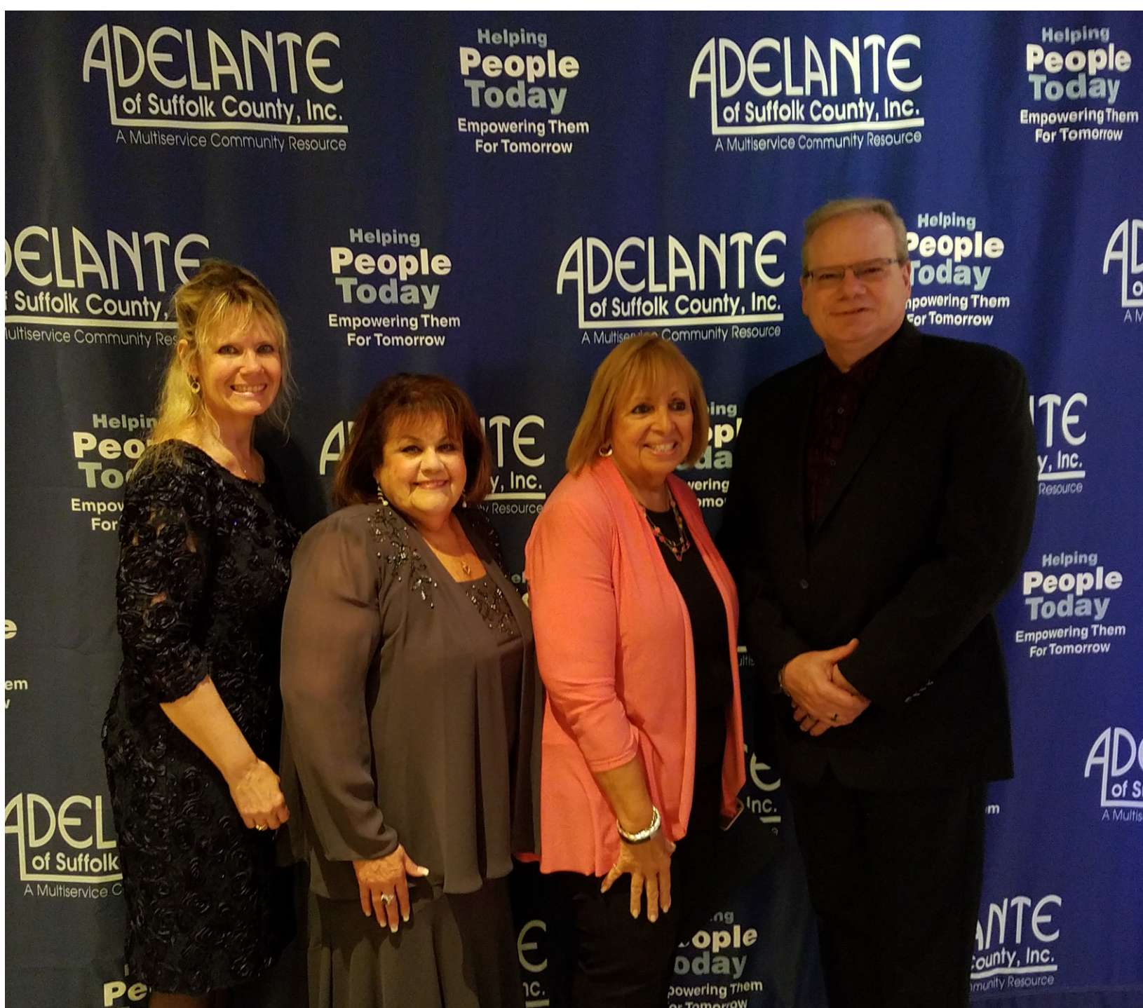
Adelante Holds Annual Fundraising Gala