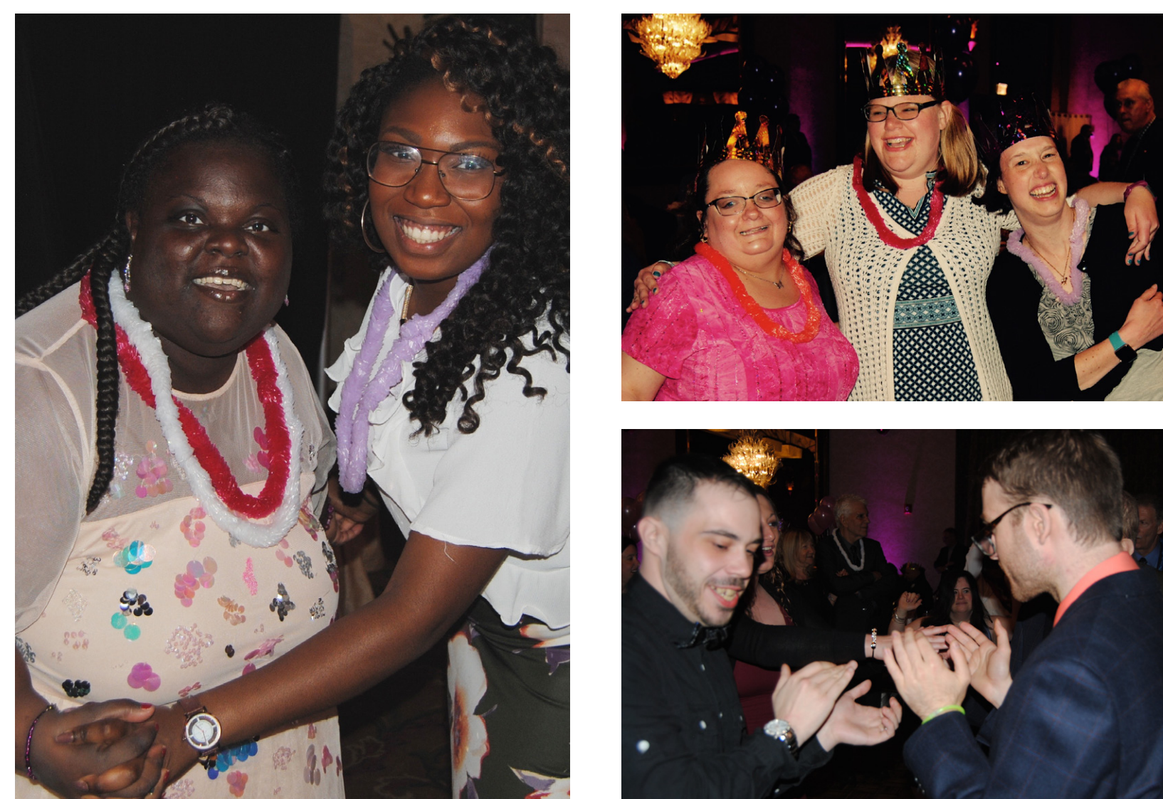
2nd Annual Symposium: Lights, Community, Let's Take Action