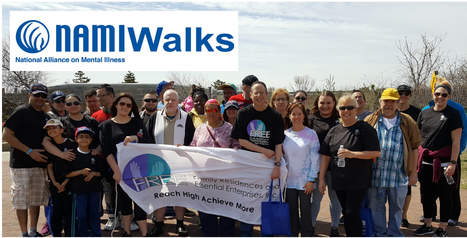
FREE Participates in NAMIWalks at Jones Beach