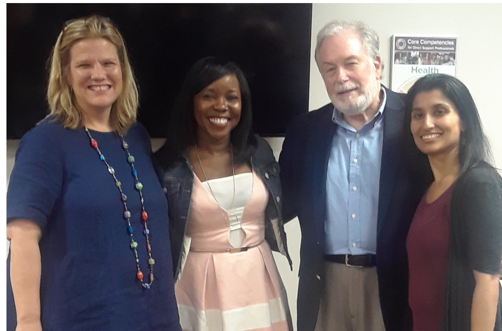
Learning About Becoming a Foster Parent