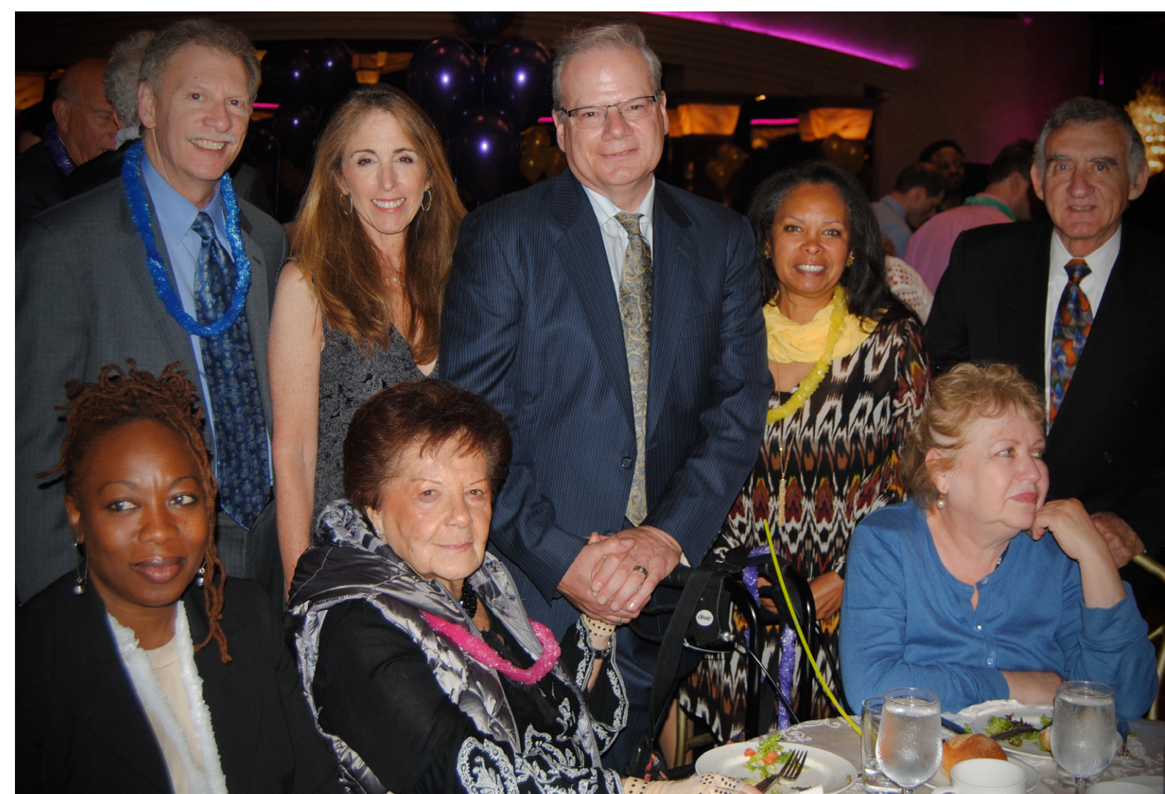
27th Annual Dinner Dance