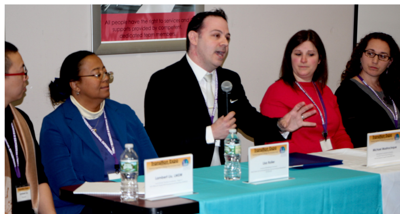
Annual Transition Expo