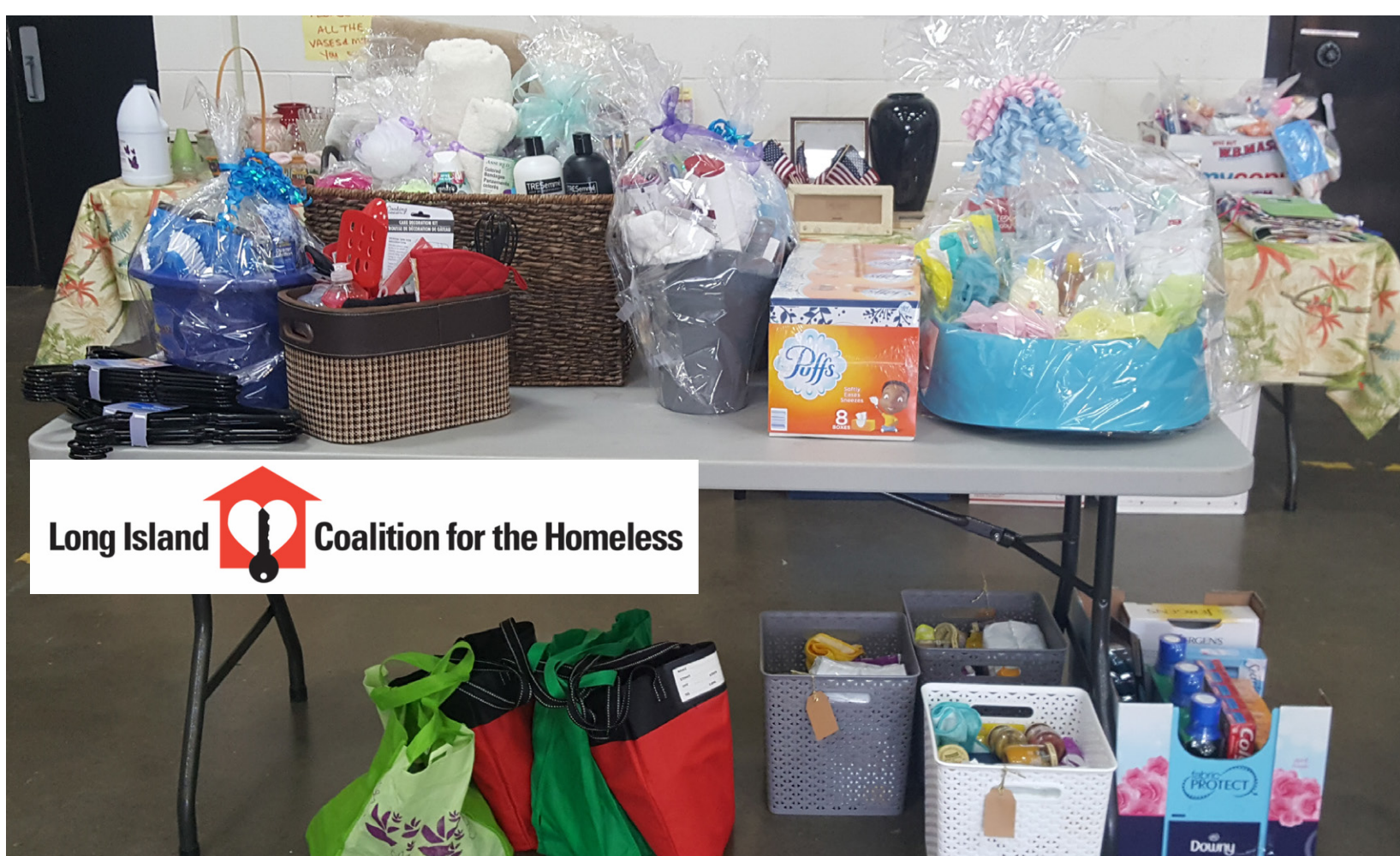
Have a Heart for the Homeless Candlelight Vigil