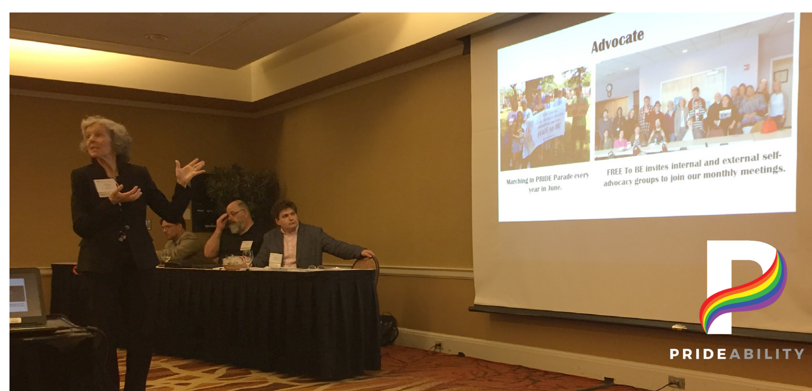
PrideAbility Holds Workshop

NEW YORK STATE NYSTART Systemic, Therapeutic, Assessment, Resources and Treatment