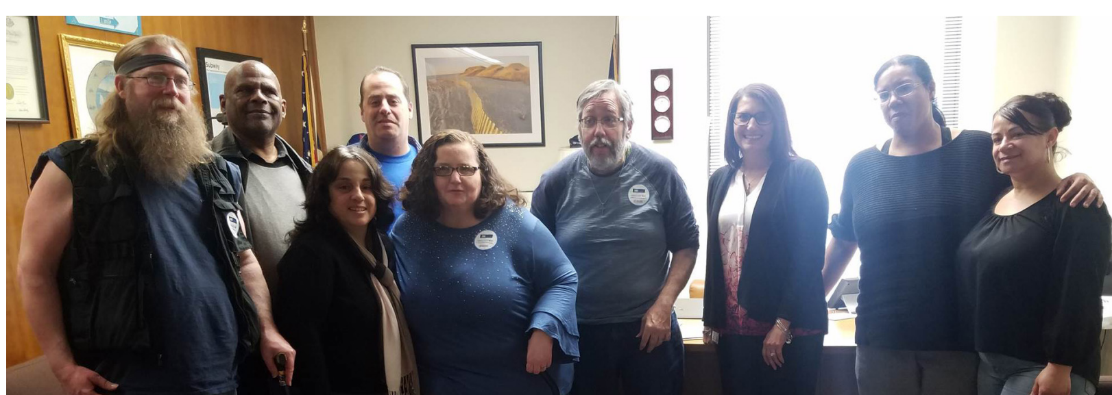
FREE Attends Advocacy Day 2018