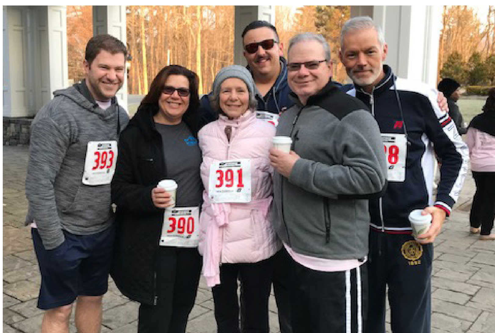
New York Alliance for Inclusion & Innovation Annual Conference