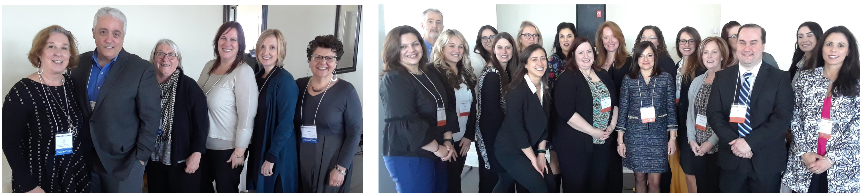
A Successful NY START Region 5 Launch