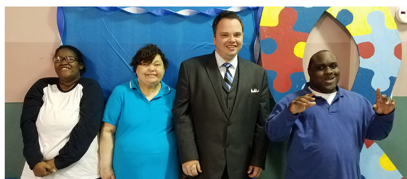
Light It Up Blue at DSW