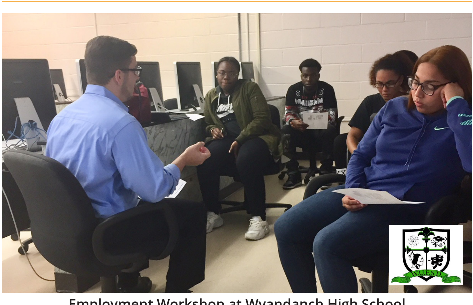
Employment Workshop at Wyandanch High School