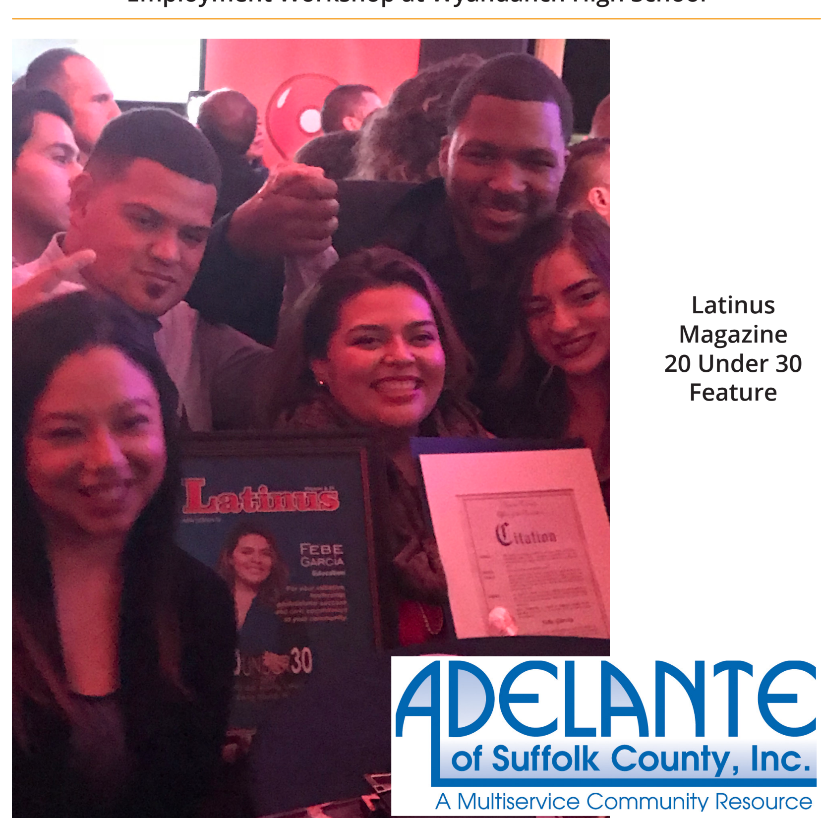
Latinus Magazine 20 Under 30 Feature