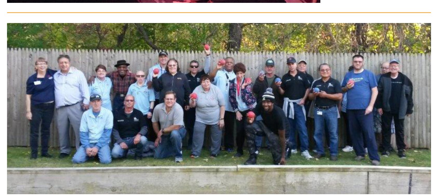
FREE Lightning/Facilities 8th Annual Bocce Invitational Game

Pronto Prepares to Help Those in Need for Thanksgiving