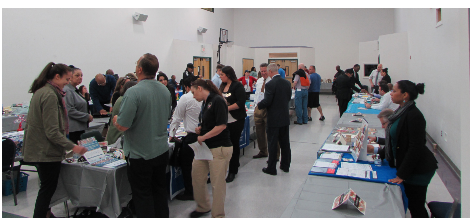
FREE hosted a resource fair for veterans.