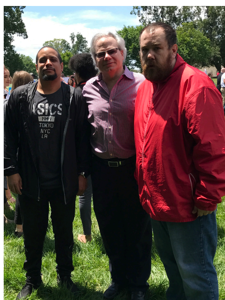
ANCOR organized a rally to show the Senate and House how important Medicaid is to the individuals we serve.