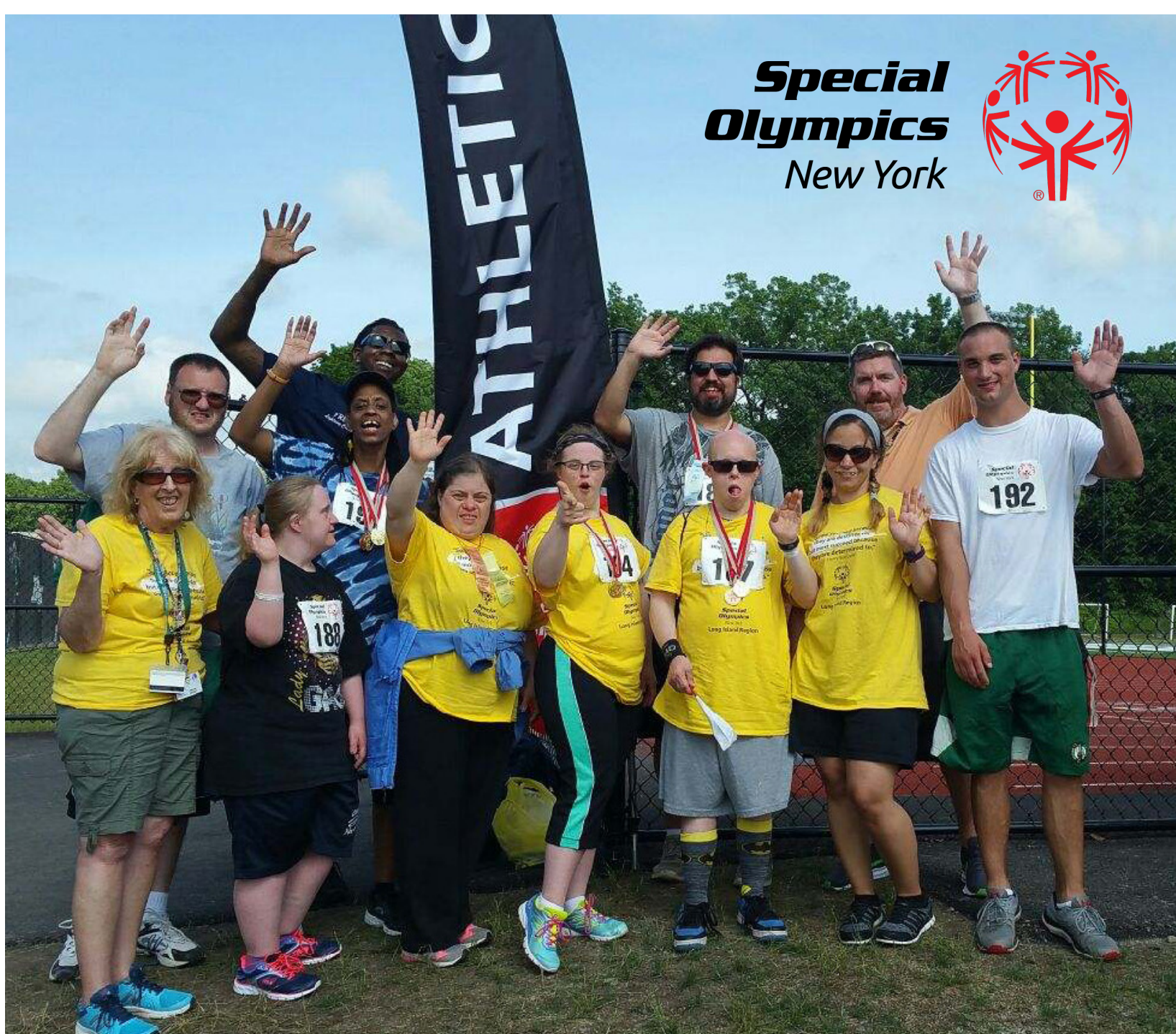
The FREE Lightning Track Team at the NY Special Olympics.