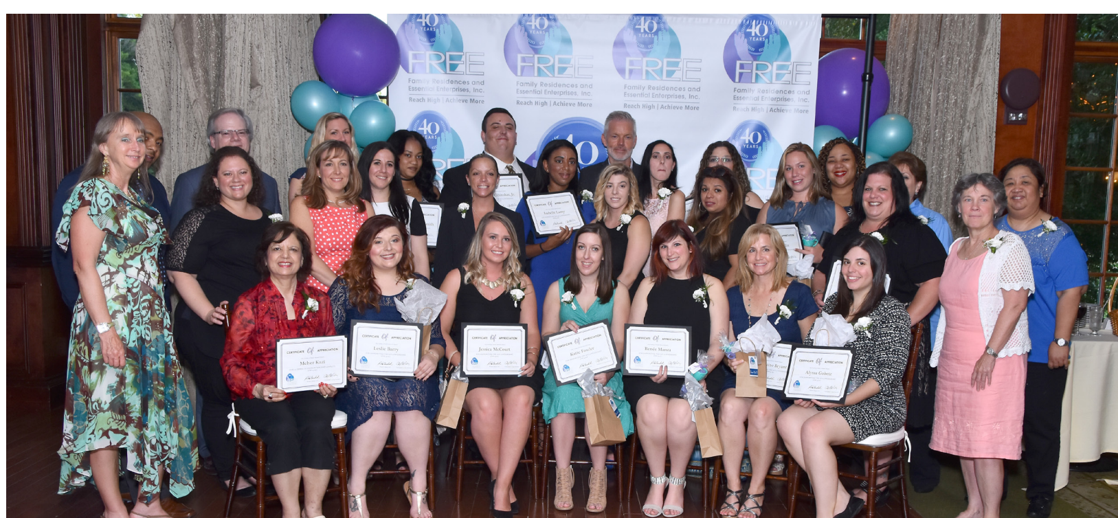
Valued Team Members enjoyed themselves at the First Annual Employee Appreciation Event.