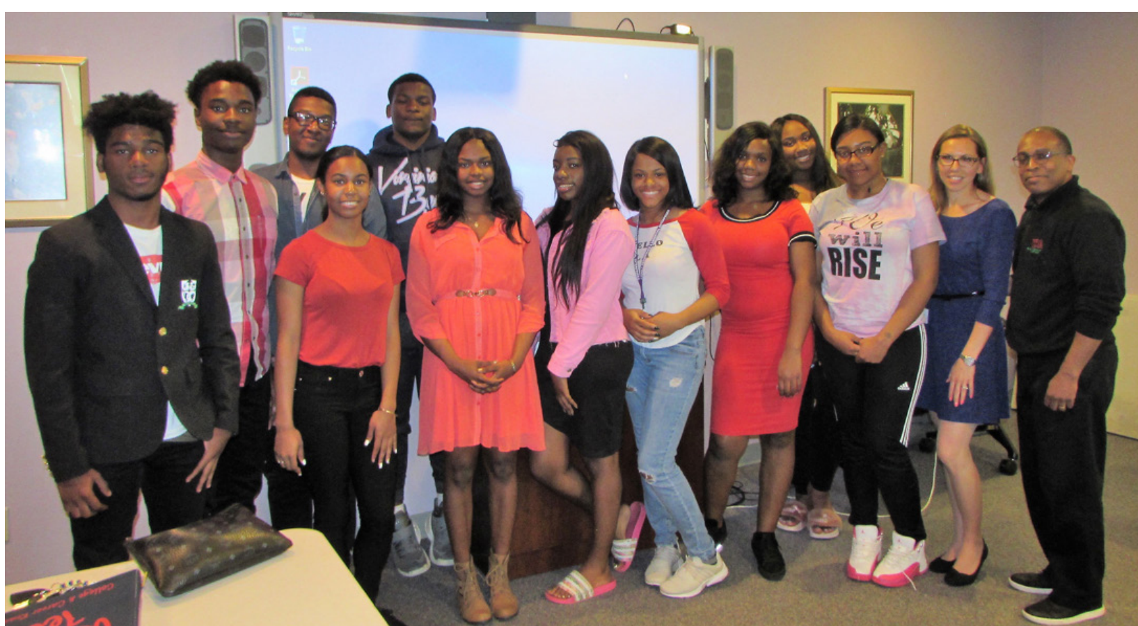
A "Culmination Ceremony" was held for Wyandanch High School seniors.