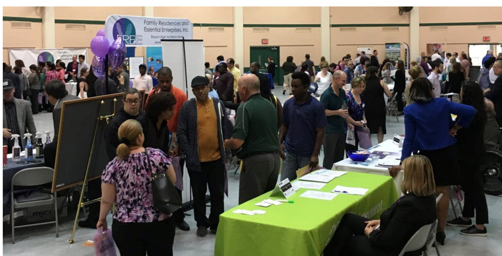
The Talent Connection Job Expo drew over 300 job seekers, companies, team members from agencies and elected officials.