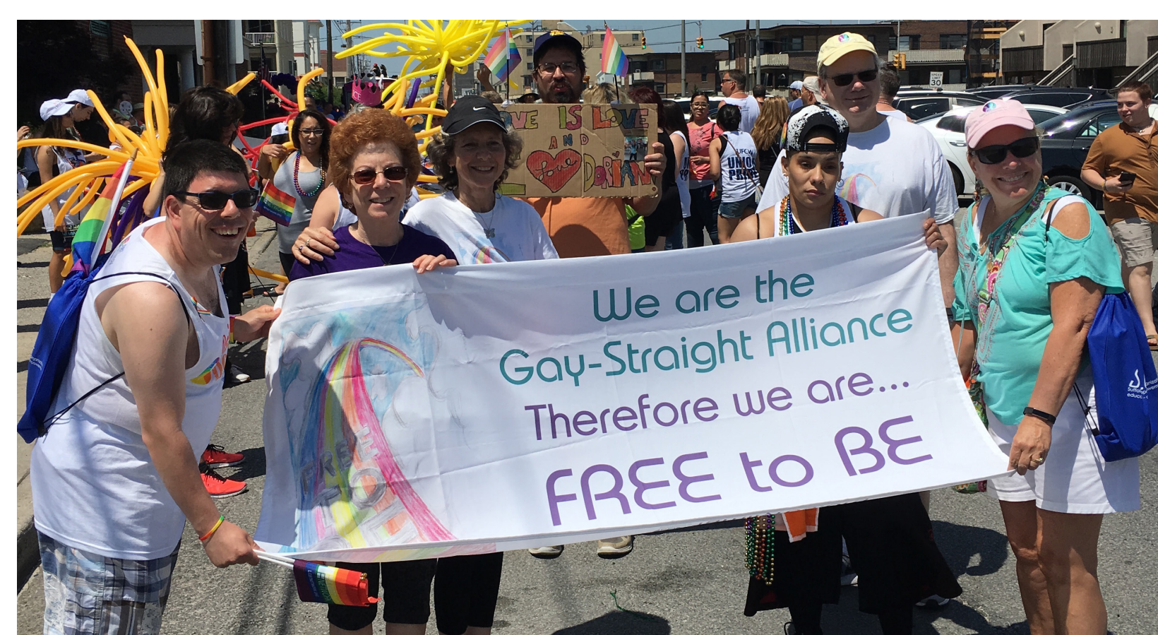
FREE To BE was thrilled to have been a part of the first Long Island PRIDE Festival that was hosted in Long Beach.