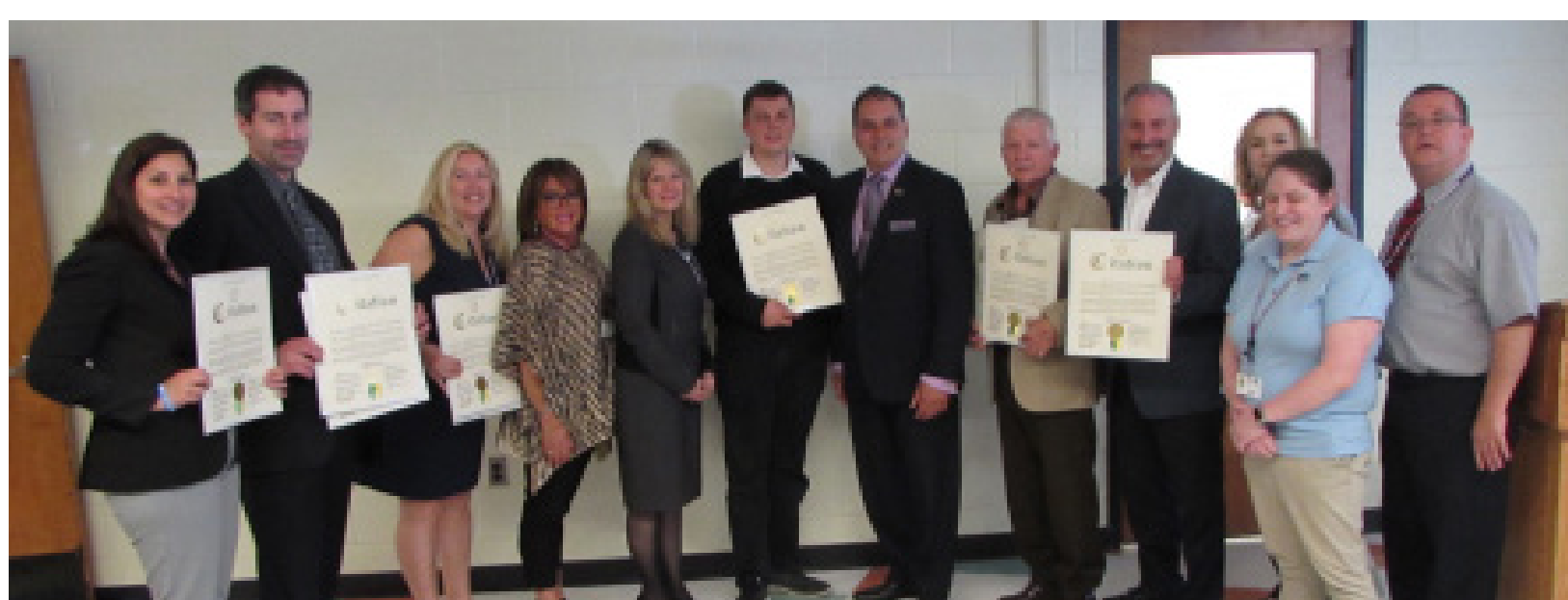
Hosted by FREE, ACLD, Life's WORC and YAI