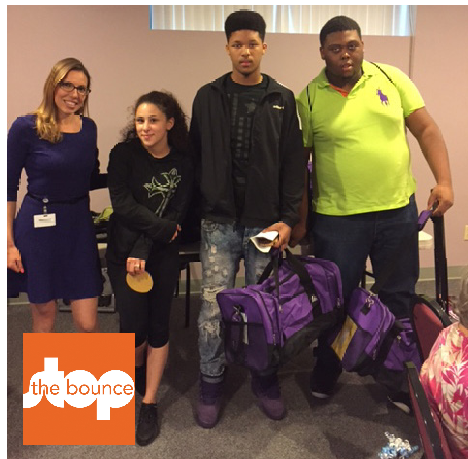
Stop the Bounce Travel with Dignity initiative.