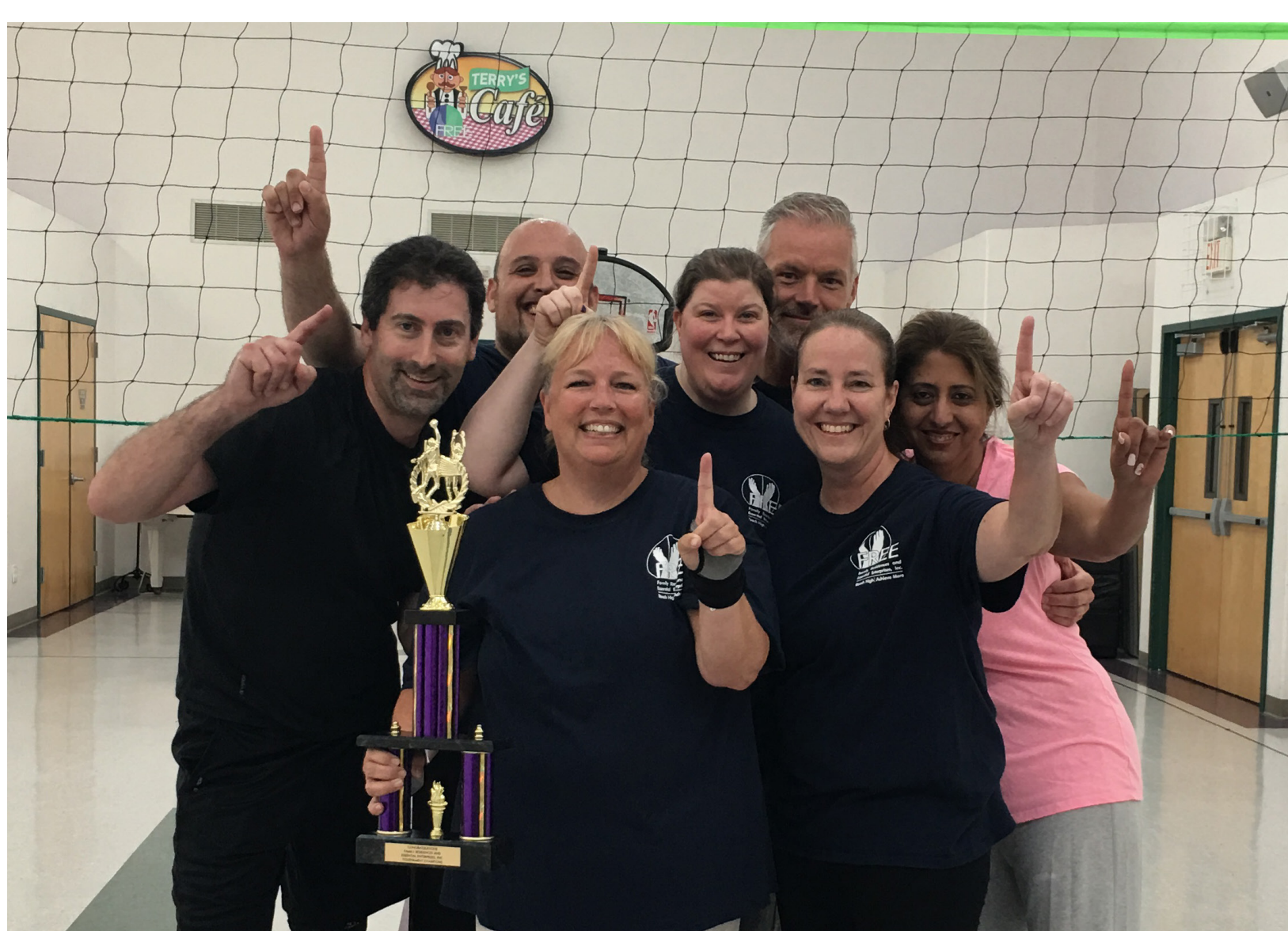
Congratulations to the FREE Avengers for winning the volleyball championship!