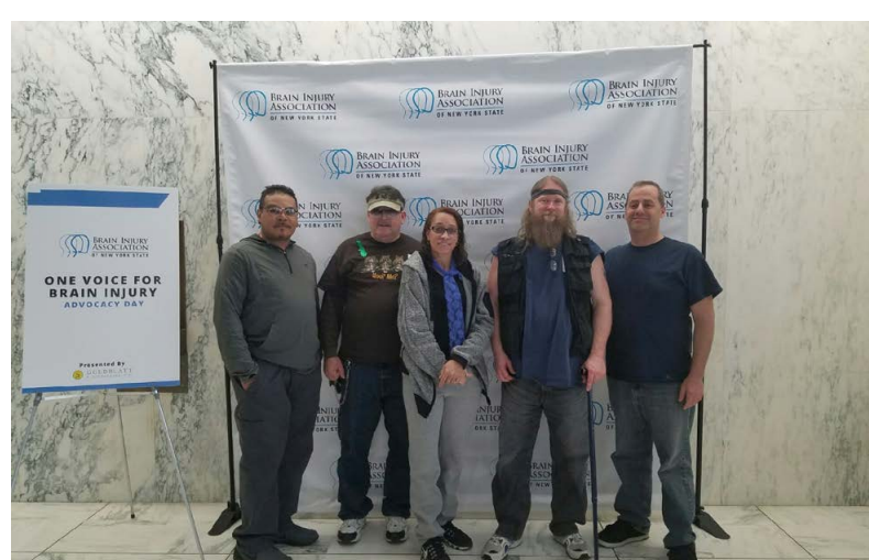
TBI team members, TBI survivors and family members at TBI Advocacy Day in Albany