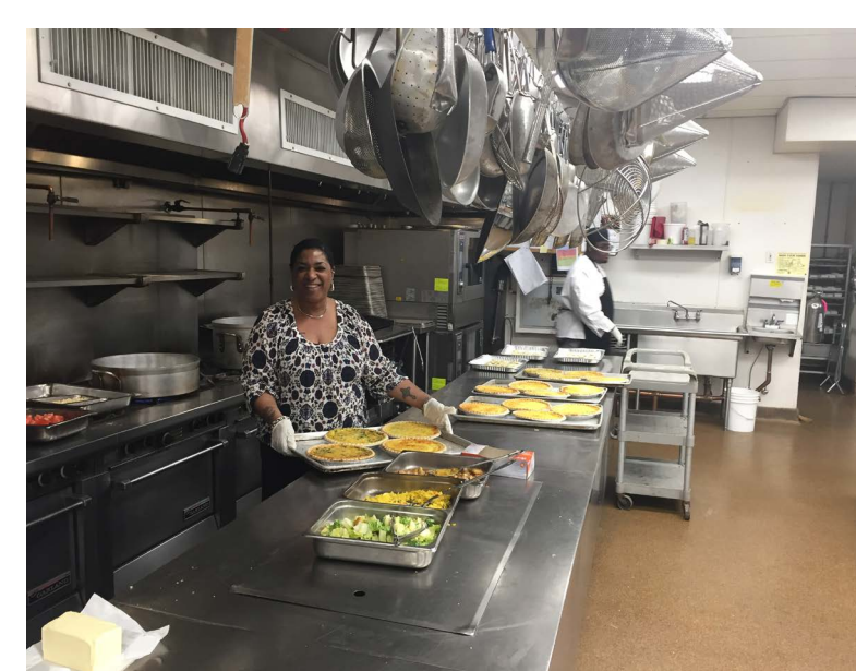
Taste of the Town TRI's Kitchen to Table Program