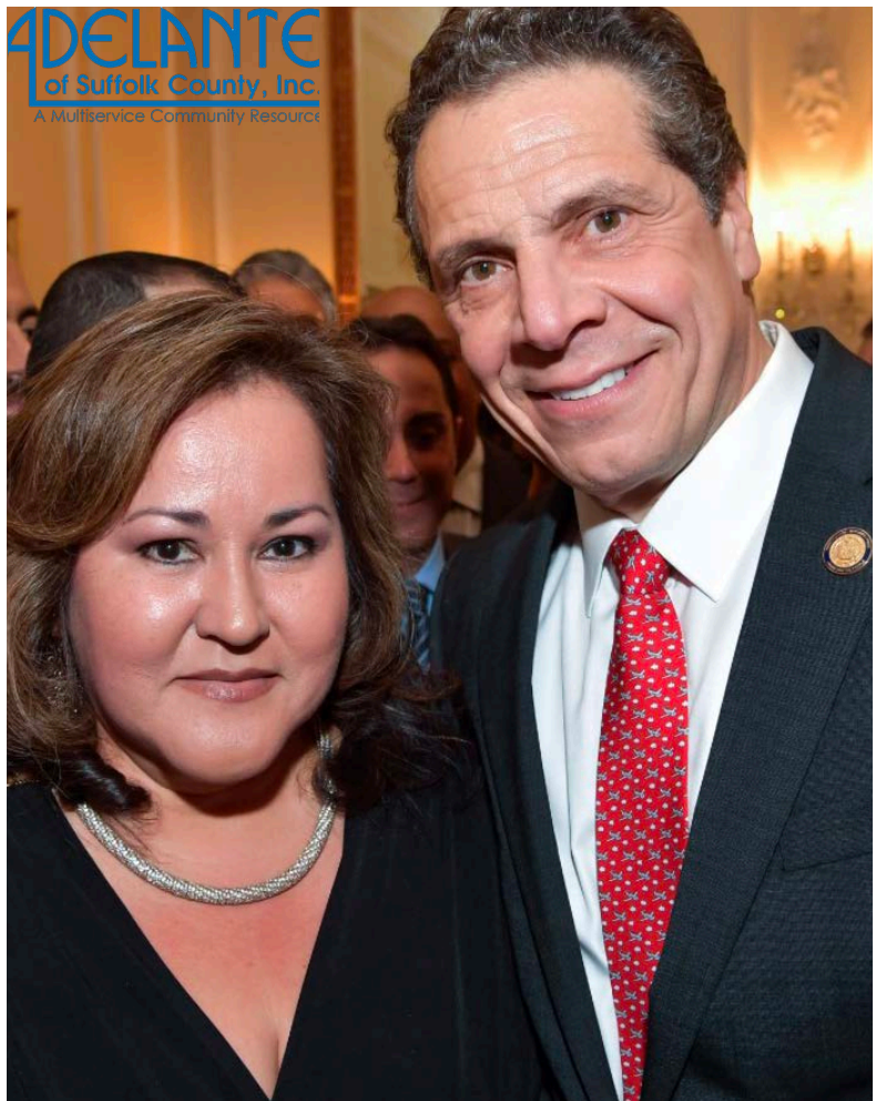
Legislative Advocacy in Albany when Governor Cuomo announced his budget plan!