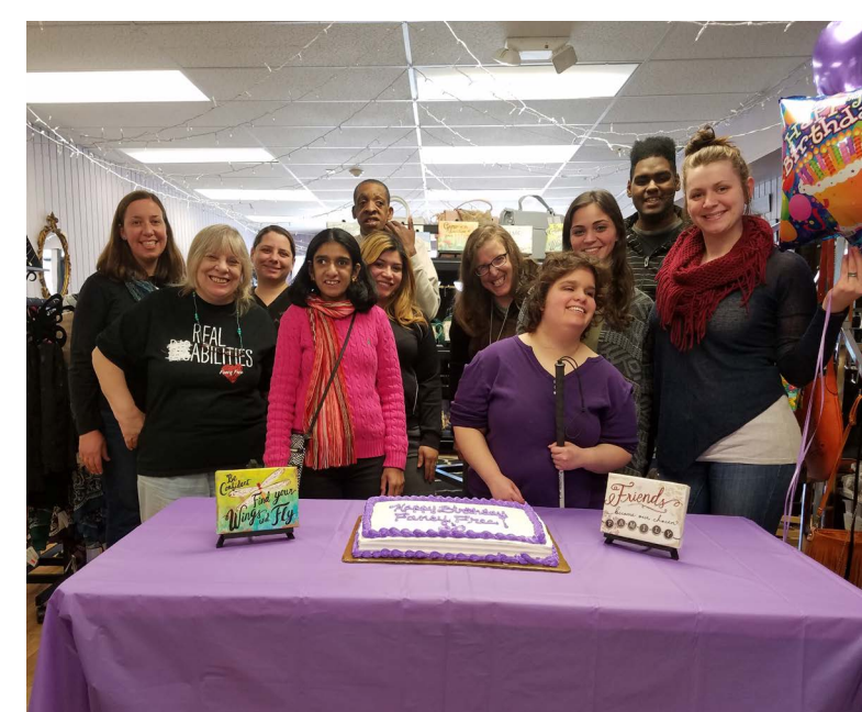
Fancy FREE celebrated their 8th Birthday