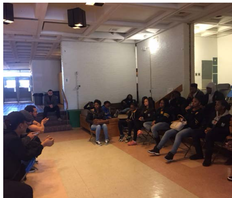
Advantage Afterschool Program provided Wyandanch HS students with a field trip to Farmingdale State College

Farmingdale State College State University of New York