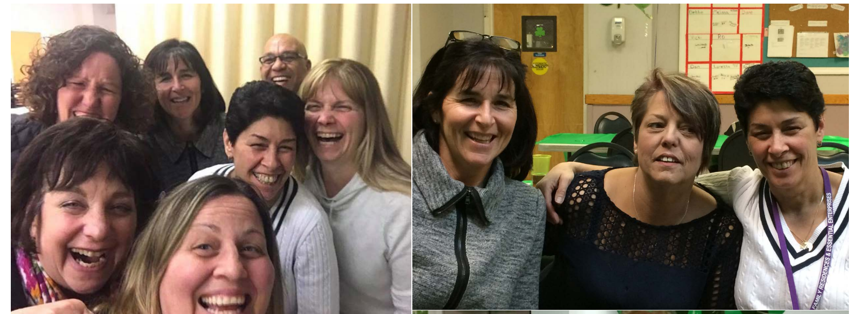
DSE Reunion Celebration

We are taking time to celebrate the lives and contributions of individuals with intellectual and developmental disabilities.