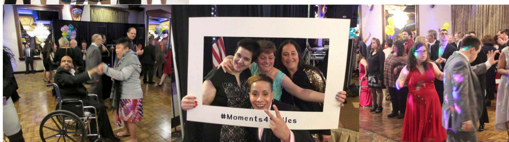
Over 550 people attended the 26th Annual Dinner Dance

MARCH IS OUR MONTH Disabilities Awareness Starts Now! FamilyRes.org