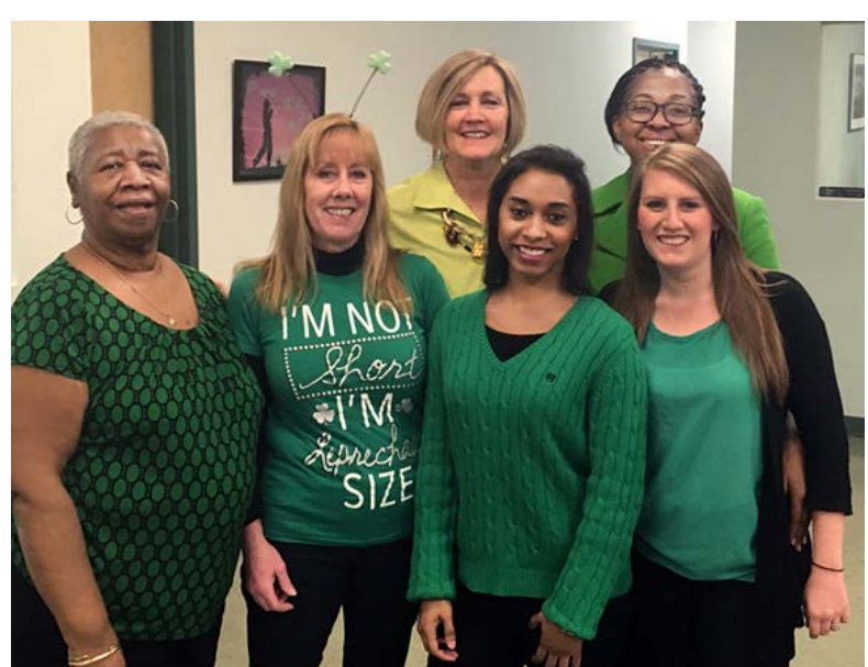
TRI Celebrated St. Patrick's Day

Farmingdale State College State University of New York