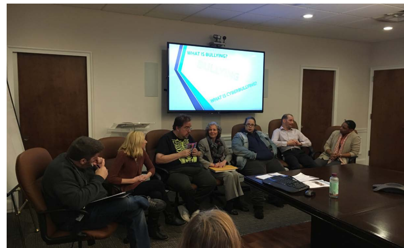
Speakers Bureau Presentation for Stony Brook Masters Cohort