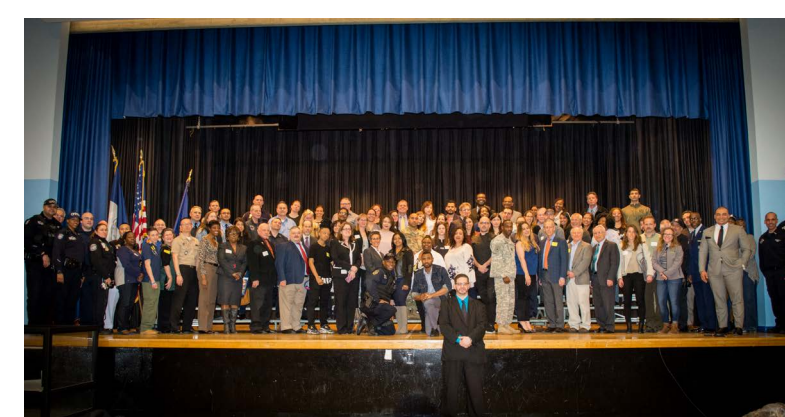
FREE's Education and Youth Services Division participated in Career Day at John Bowne High School in Flushing, Queens