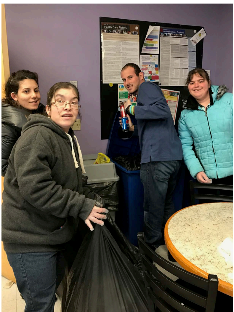
PWW Recycling Program