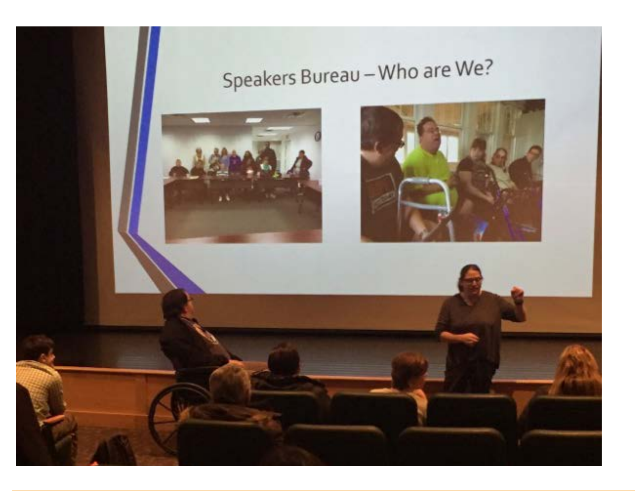
The FREE Your Mind Speakers Bureau Presented to PWW

$27,648 - Youth Leadership and Family Education