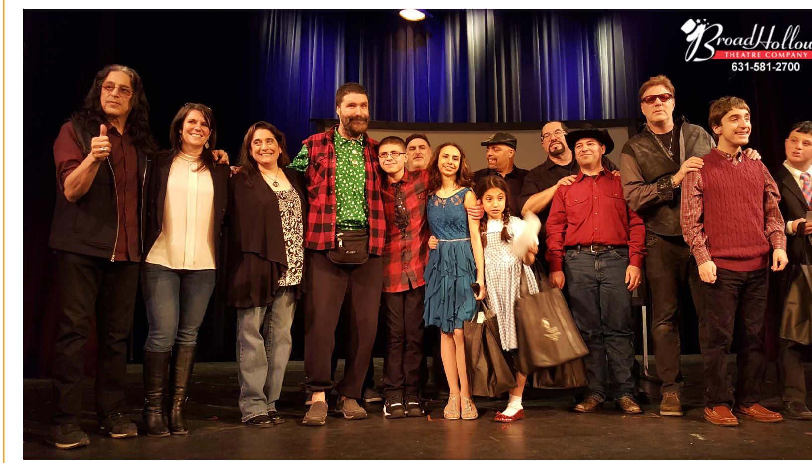
Special Needs Got Talent in partnership with BroadHollow Theatre Company