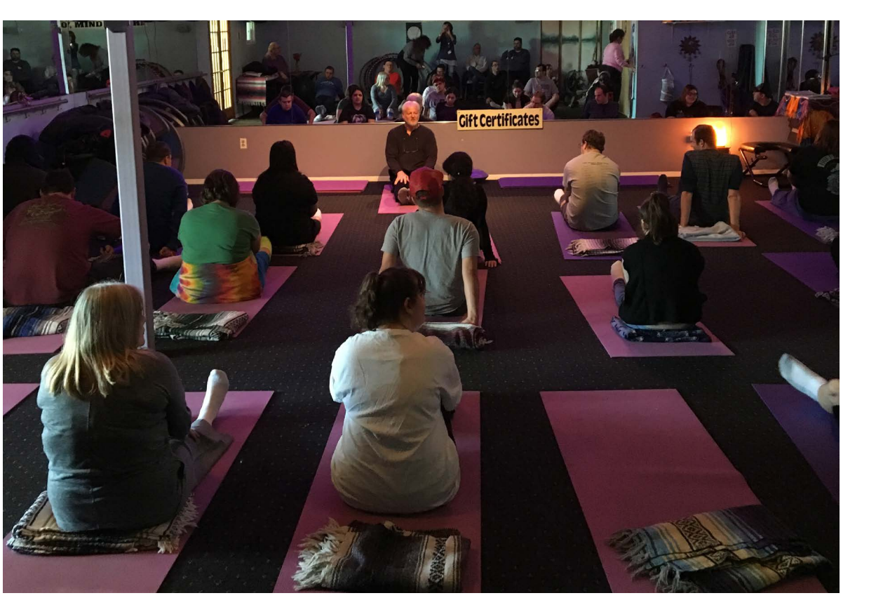
PWW Participants enjoyed a stress-free yoga class